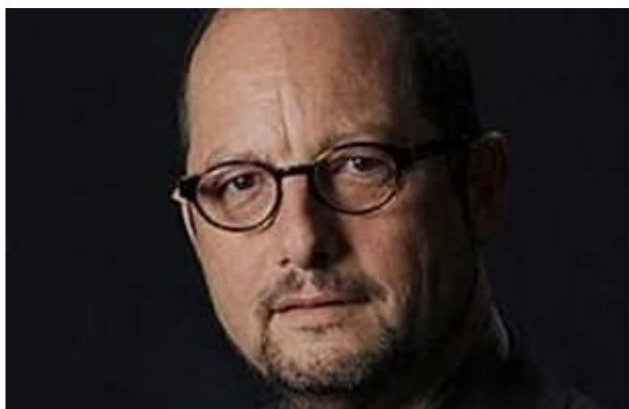
Bart D. Ehrman*