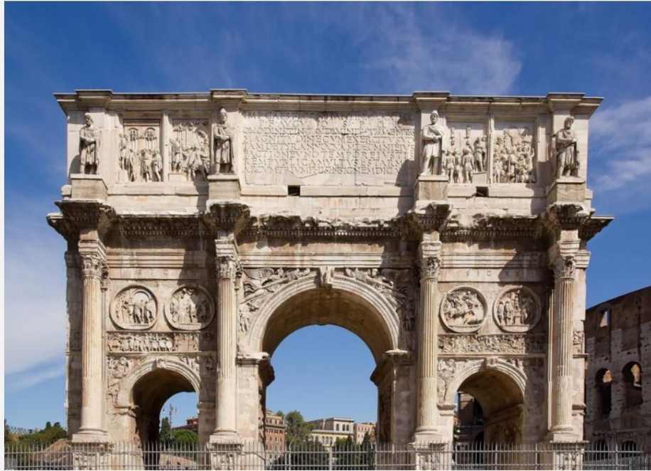
Rome. Triumphal arch dedicated to Emperor Constantine I.