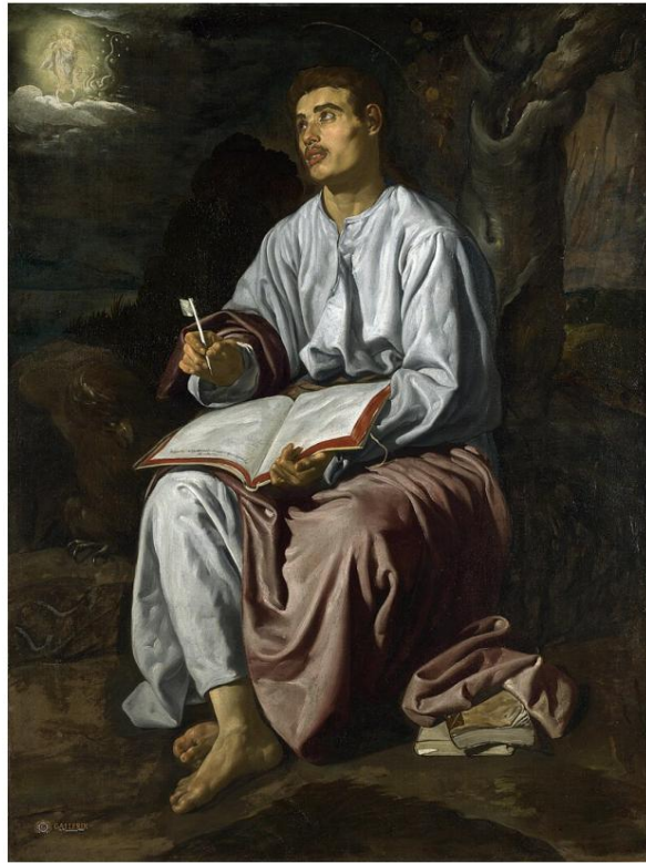
Diego Velázquez's masterpiece St. John the Evangelist